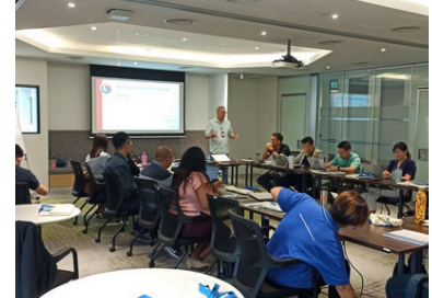
Clarus Consulting (GIMI CTP in Malaysia)

Celebrated the 20th Anniversary of the Campeãs da Inovação – the first innovation ranking in Brazil that uses GIMI's innovation methodology