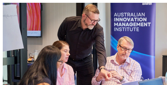
Australian Innovation Management Institute (GIMI CTP in Australia)

Trained 20 NGO leaders on GIMI's framework, preparing them to scale the GIMI impact program