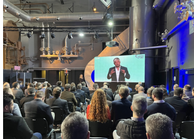
IXL Brazil (GIMI CTP in Brazil)

Won a program which aims to train and mentor 40 companies in the Mexican state as well training Monterrey Tech professors on Level 2