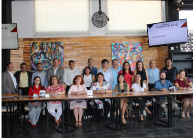
TDM Internacional (GIMI CTP in Mexico)

Here are some of the things they've done in March and April 2024: