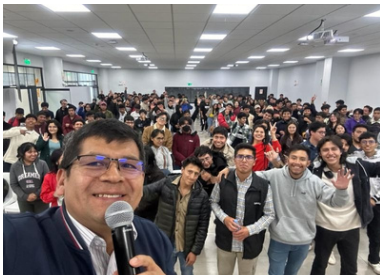
APESOFT (GIMI CTP in Peru)

Issued 40 certificates in 2 back-to-back workshops held for employees from various companies and students from different institutions