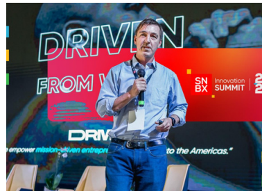
SNBX El Salvador (GIMI CTP in El Salvador)

Signed the contract to certify 200 students as Innovation Catalysts at Continental University this year