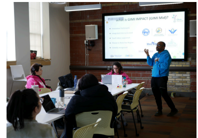
SWRIL (GIMI CTP in Canada)

Hosted a large innovation summit in San Salvador where over 400 people participated